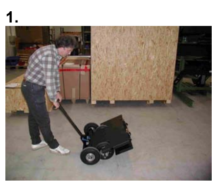
Position the steering shaft and tighten the blue lever.