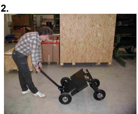
The Husky can now be flipped open.